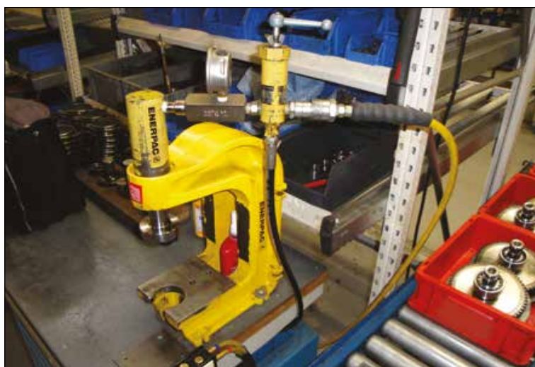
▲ RC308 cylinder mounted in A330 Arbor Press powered by a PATG-Turbo Air pump for controlled pressing of bearings for sprockets of weaving machines. The V152 Pressure Relief Valve controls the pressing force.