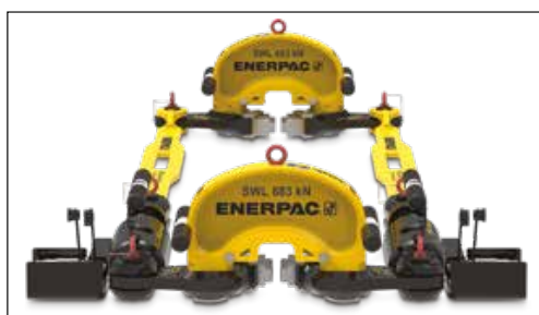
◀ Modular 70 ton stressor and holds the rail in neutral length during the welding process.