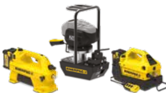
Cordless Hydraulic Pumps