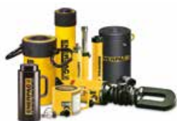
Cylinders & Lifting Products