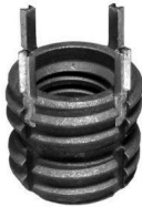
Heavy Duty – Stainless Steel Internal-Thread Locking

Stainless steel version of our general-purpose threaded inserts with a thick, heavy-duty thread wall. Key Inserts are ideal for thread reinforcement, especially when the mating stud or bolt will be removed frequently. These stainless inserts provide strong, permanent stainless steel threads in any parent material, ferrous, non-ferrous, or non-metallic. Key Inserts are also well suited for quick repair of stripped, damaged, or worn threads. Locking keys positively prevent the insert from rotating.