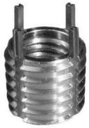
Heavy Duty – Stainless Steel

BODY: 303 STAINLESS STEEL. KEYS: 302 STAINLESS STEEL