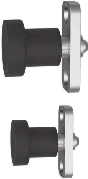
Knob Handle with Mounting Plate (Locking Type)

KNOB: MATTE BLACK FIBER-REINFORCED NYLON THERMOPLASTIC PLUNGER: STEEL, HEAT TREATED BODY PLATE: STEEL, ZINC PLATED CLEAR CHROMATE