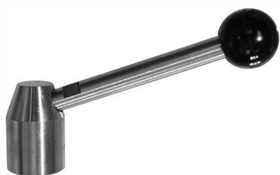
Single Lever Handle