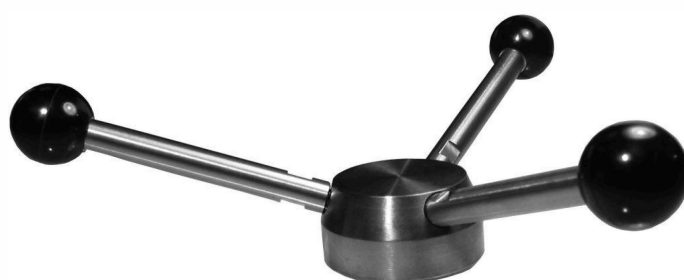
Triple Lever Handle

Fast, efficient levers that provide high torque. These attractive Lever Handles are made of 300-series stainless steel, polished to a beautiful finish. Hubs are available in single-handle or triple-handle versions, each in two sizes. Lever Handles can be totally customized by choosing Lever Bar length and Knob type.