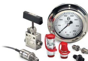
High pressure fittings