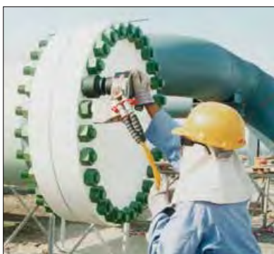
◀ Easy and reliable service in the field using Enerpac SQD-series torque wrenches.