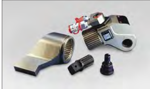
▲ All wrenches come standard with swivel coupler, square drive and reaction arm.