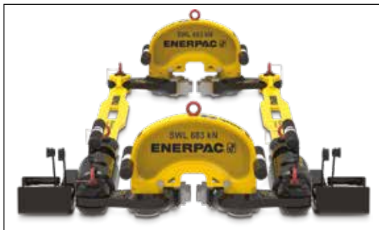
◀ Modular 70 ton stressor and holds the rail in neutral length during the welding process.